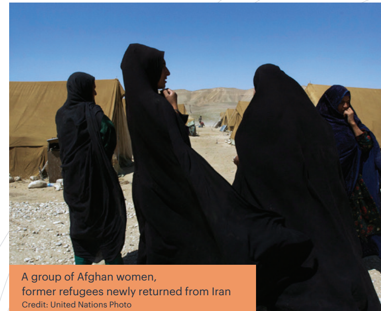
A group of Afghan women, former refugees newly returned from Iran

There is no one size fits all approach. As such, it matters a great deal in terms of a more successful outcome whether the transitional justice approach negotiated and crafted in the peace agreement is tailored to the needs and realities of the specific context. As Daly points out '[e]ach country's transitional path consists of a unique constellation of social, historical, political, economic, ethnic, racial, religious, military, and other factors; these factors distinguish each transition from the others; and it is these differences in transitions that compel different institutional responses to past wrongs' (Daly, 2002, 77). That is why the African Union Transitional Justice Policy stipulates that the 'choice of TJ should be context-specific, drawing on society's conceptions and needs of justice and reconciliation, having regard to: The nature of the conflict and the violations it occasioned, including