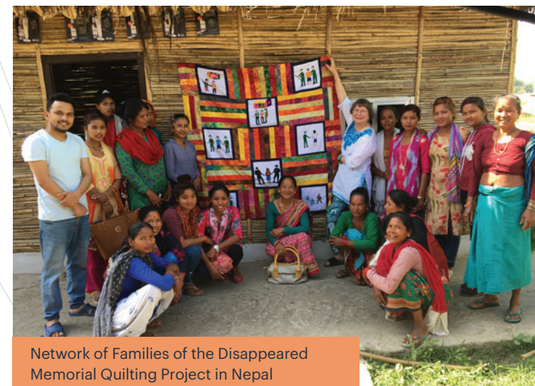
Network of Families of the Disappeared Memorial Quilting Project in Nepal

The various case studies that are the subject of this conference and other experiences show that how the issue of transitional justice is included as an agenda of the peace process