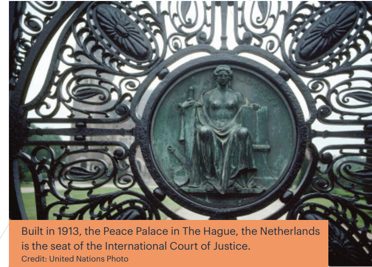
Built in 1913, the Peace Palace in The Hague, the Netherlands is the seat of the International Court of Justice.

Accountability should also be designed in a way that maximizes institutional linkages. Domestic and international accountability mechanisms can cooperate in capacity-building, information-sharing, and case transfers. At the domestic level, for accountability to be credible it likely must be preceded by institutional reforms that may include vetting and legal reform. Judicial processes may also be tied to other transitional justice components, such as by receiving case referrals from truth commissions or issuing reparations orders.