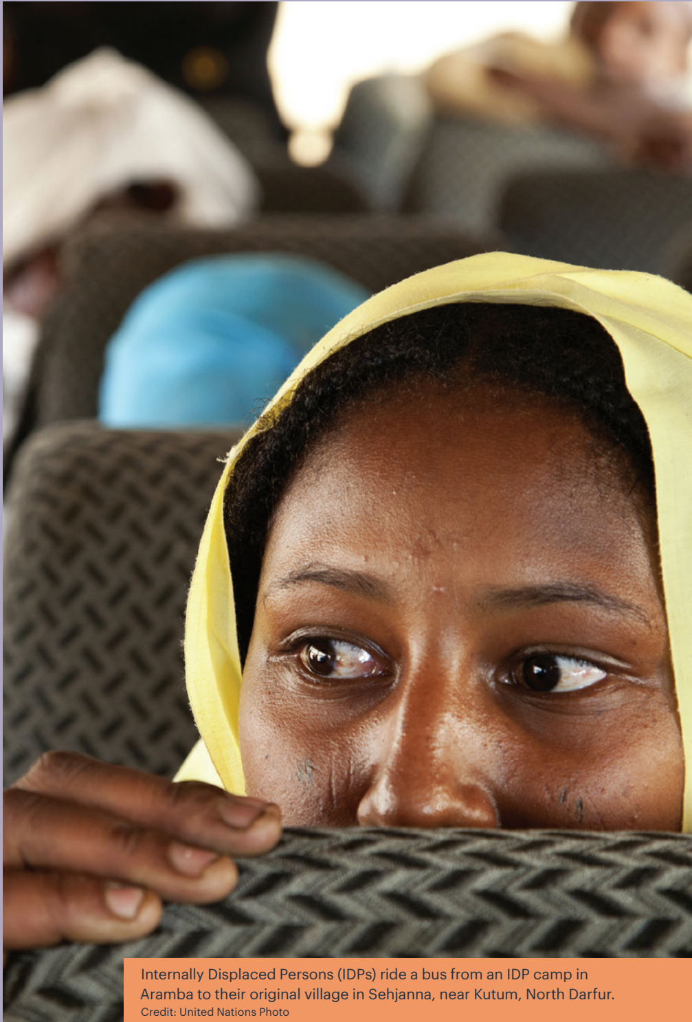
Internally Displaced Persons (IDPs) ride a bus from an IDP camp in Aramba to their original village in Sehjanna, near Kutum, North Darfur.