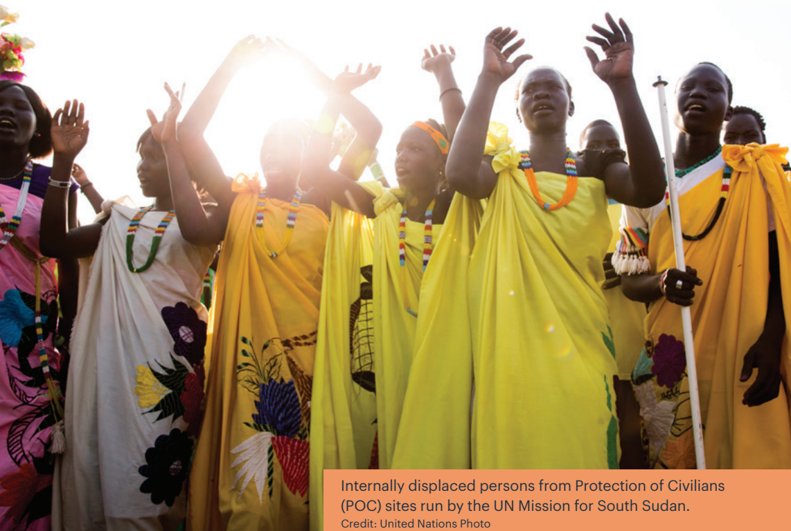
Internally displaced persons from Protection of Civilians (POC) sites run by the UN Mission for South Sudan.

On how the nature of the conflict affects the choice and/or design of transitional justice mechanism/s, Duthie states the nature of conflict and political violence 'raises questions about the human rights violations to be addressed, the types of trust or reconciliation that need to be fostered, and the appropriate measures to do so' (Duthie, 2017, 16). Thus, whether the conflict is 'intra-state wars, inter-state wars, non-state armed conflicts, military coups, elections-related political violence, or one-sided violence' would be among the considerations in the type, nature and design of the transitional justice approach that the parties could negotiate and agree to (Duthie, 2017, 17).