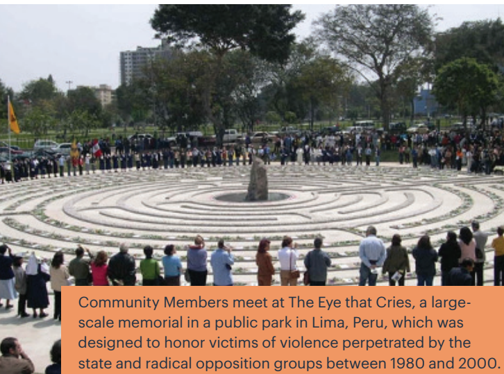
Community Members meet at The Eye that Cries, a large-scale memorial in a public park in Lima, Peru, which was designed to honor victims of violence perpetrated by the state and radical opposition groups between 1980 and 2000.

A comprehensive program also has the advantages of creating multiple