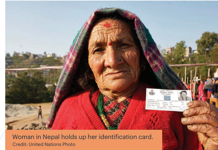
Woman in Nepal holds up her identification card.

To avoid these outcomes, negotiators may adopt a number of strategies to ensure that transitional justice is given its due. First, they can mitigate the apparent tradeoffs between peace and justice by suggesting that the two be viewed instead as mutually reinforcing. According to the "peace with justice" conceptual framework, peace and justice are inextricably linked and may be productively pursued in parallel. Advocates might illustrate the need for justice in order to secure a sustainable peace and present restorative, rather than retributive, models. This expanded notion of justice is supported by the different modes of transitional justice and the different harms it is intended to redress, which may include cultural, democratic, dignitary, distributive, and moral harms.