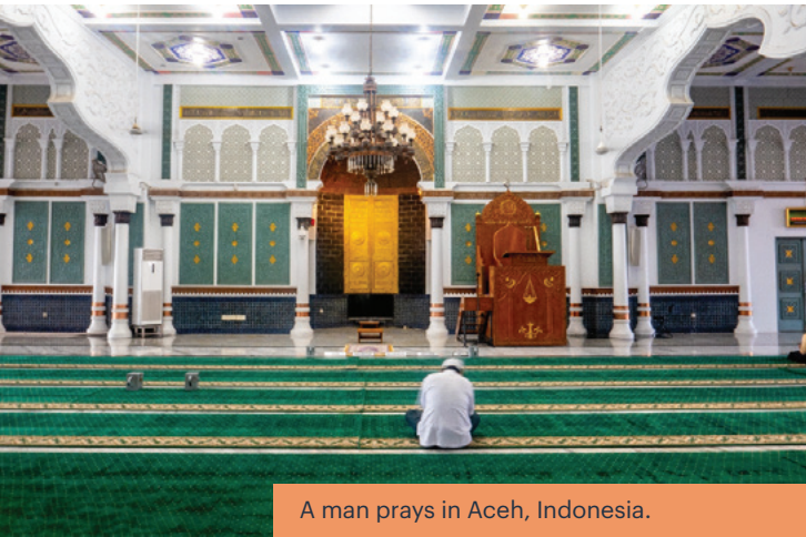
A man prays in Aceh, Indonesia.

that period was the emergence of an approach for limiting the use of blanket amnesty in peace processes. As Hayner observed, '[i]n the negotiated agreements in El Salvador (1992), South Africa (1993), and Guatemala (1996), the parties agreed to compromises that kept blanket amnesty out of the negotiated text' (Hayner, 2018, 11).