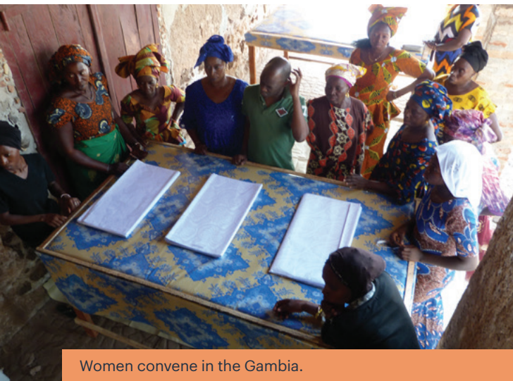
Women convene in the Gambia.

Perhaps the most critical aspect of a truth commission is