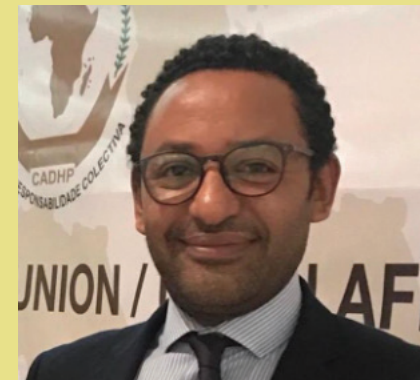
Solomon Ayele Derso, PhD, Chairperson of the African Commission on Human and Peoples' Rights and Focal Person on Transitional Justice for the Commission

Given the focus of this conference on transitional justice in peace processes, my address will accordingly focus on the issues that affect the negotiation of transitional justice in peace processes.