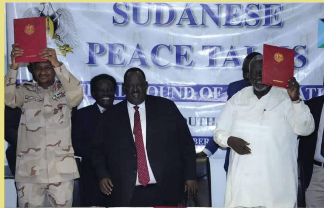
Government and opposition parties seated at the negotiating table in Juba during the Sudanese peace talks in 2020.

This briefing paper presents lessons and recommendations as to how peace processes can best nurture and promote transitional justice. It discusses strategies that stakeholders might adopt in order to motivate genuine discussion of transitional justice and break deadlocks, design robust and responsive programs, and boost compliance. It also provides specific guidance on the five core elements of transitional justice: accountability, truth-telling, reparations, institutional reform, and memorialization.