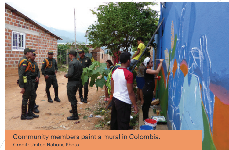
Community members paint a mural in Colombia.

Because transitional justice is intended to benefit the public at large, and especially victims of abuses, it makes sense to include their representatives at various stages of the process. During negotiations, civil society and victims' groups may be consulted as to their views on the shape and priorities of transitional justice. Peace agreements also broaden their appeal by providing for the participation of civil society in transitional justice institutions. This might include reserving positions on commissions for civil society leaders, accepting civil society-produced documentation as a source of evidence, or providing funding for memorialization or other projects led by civil society organizations and victims' groups. Lastly, peace agreements can instill public confidence and accountability by involving civil society actors in the oversight of transitional justice. In addition to any roles formally assigned to it by the peace agreement, civil society may of course also support transitional justice through advocacy, outreach, and education.