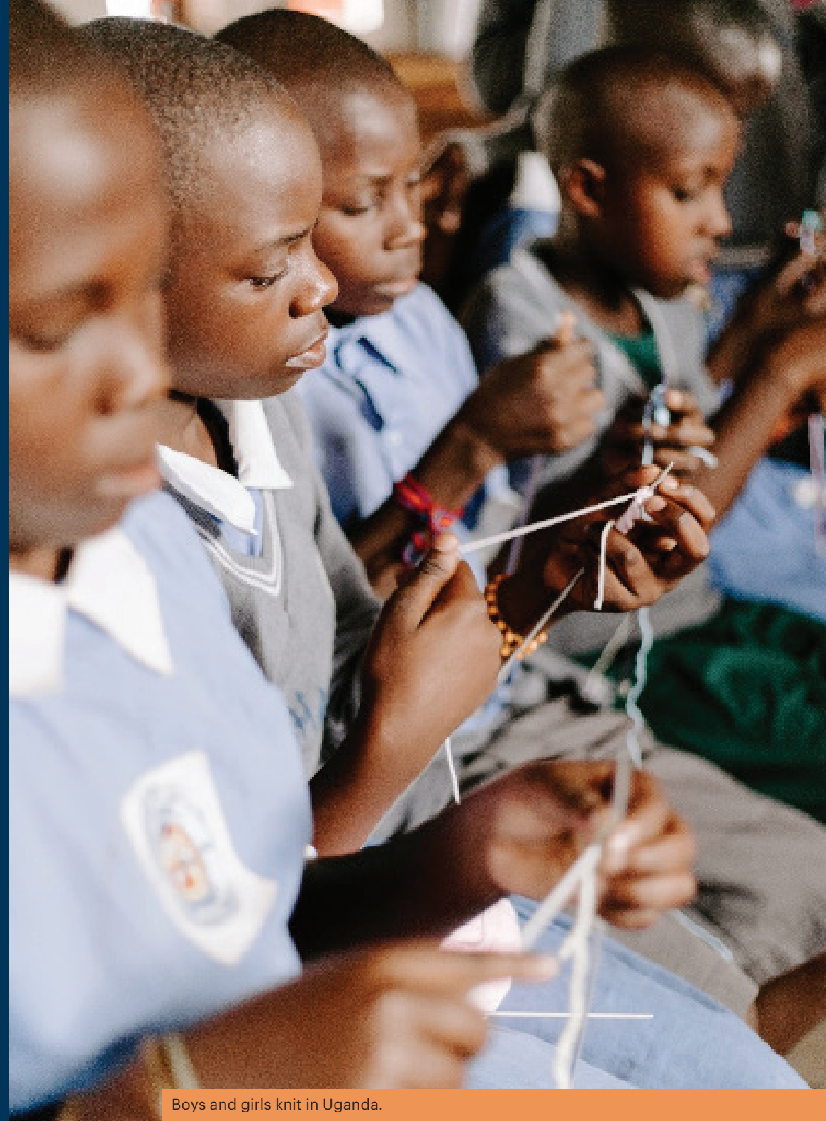
Boys and girls knit in Uganda.

Given the diversity of experiences, knowledge and skills within the Consortium and the ICSC's network members, the Consortium's programming offers post-conflict countries and countries emerging from repressive regimes a unique opportunity to address transitional justice needs in a timely manner while simultaneously promoting local participation and building the capacity of community partners.